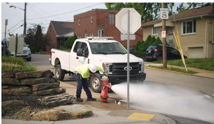
Valve & Hydrant Specialist Josh Reeves flushes a hydrant in Mount Washington. PWSA services and maintains a network of around 7,500 fire hydrants throughout our service area.

▶ All of us here at PWSA take immense pride in delivering clean, safe drinking water to the more than 500,000 consumers we serve in the region. In a typical day we produce an average of 70 million gallons of drinkable water, but the water treatment process takes longer. From the point where water is drawn from the Allegheny River to the point where it reaches your tap, that process can take up to three days.