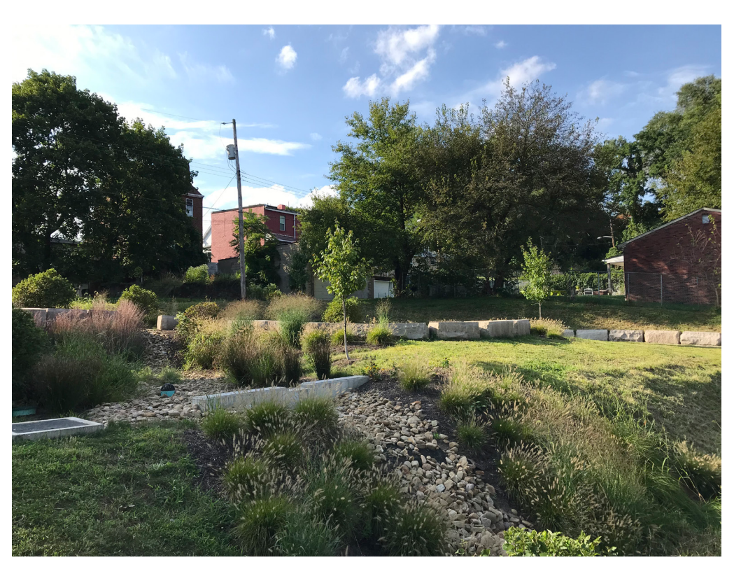
The Hillcrest Stormwater Parklet Project in September 2019, 1.5 years after planting.