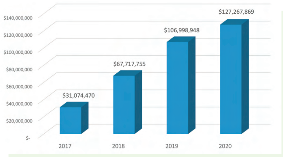
ACTUAL ANNUAL CAPITAL INVESTMENT 2017-2020

SINCE 2019, WE HAVE SAVED RATEPAYERS ROUGHLY $80 MILLION BY USING THESE FEDERAL AND STATE FUNDING PROGRAMS OVER TRADITIONAL BOND FINANCING.