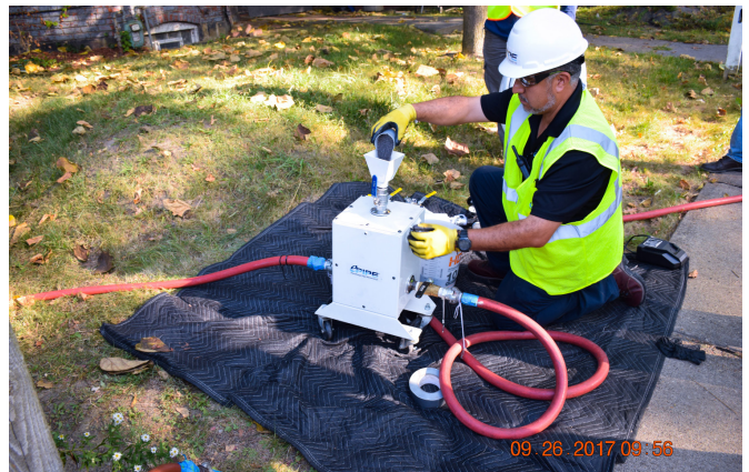
PWSA is performing a pilot test of epoxy lining of a private lead service lines in six homes.

Like many water systems of its age, PWSA is addressing the risks presented by lead pipes in its old water infrastructure. PWSA is committed to working with the community to identify solutions to reduce the risk of lead exposure, including replacing lead service lines. In addition, PWSA is concurrently pursuing alternative water treatment methods to minimize corrosion from lead pipes and plumbing. The Authority encourages customers to learn more about lead in water at lead.pgh2o.com .