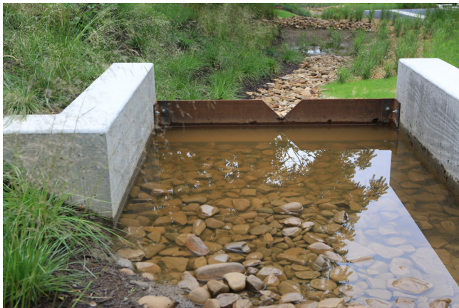
The Centre and Herron Green Infrastructure project, located in the Upper Hill District is one of three green stormwater projects completed in 2018.

Adopting a green first approach provides the ability for PWSA to meet regulatory compliance, reduce the hazards of flooding throughout Pittsburgh, and individual green infrastructure projects will enhance the urban environment and generate economic benefits throughout our neighborhoods.