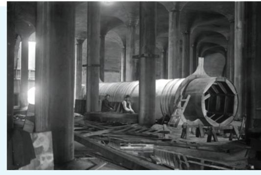
▲ Crews build the original Clearwell in 1906.

The Pittsburgh Water and Sewer Authority (PWSA) is increasing its spending on critical water infrastructure improvements. Despite construction delays due to the pandemic, our total capital investment in 2020 totaled approximately $127 million, an increase from 2019 and our largest annual investment. The investment will continue as we renew large water infrastructure and rehabilitate our network of water and sewer pipes that carry water to and from homes and businesses.