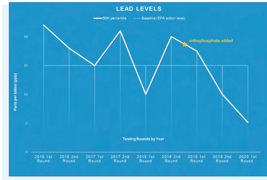
* A graph showcasing a steep decline in lead levels after we introduced orthophosphate into our water distribution system in 2019.

The lower lead testing results occurred over time. After adding orthophosphate to our drinking water treatment process in 2019, lead levels began to decline at a steeper rate and fell into compliance last year. The lower lead testing results show that this commonly used treatment method is effective. We recognize there is no safe level of lead and are working towards our goal of replacing all lead service lines by 2026.